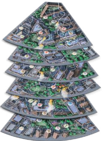
6 Map board sections (double-sided)