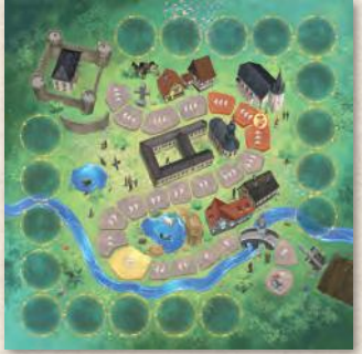
Back Side: Revenge of the Rockenberg Robber Barons