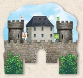
1 Rockenberg Castle Standee