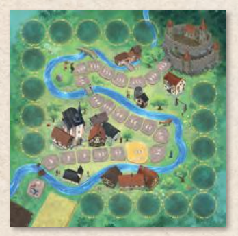
Front Side: Ambush at Münzenberg Castle