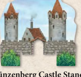
1 Münzenberg Castle Standee