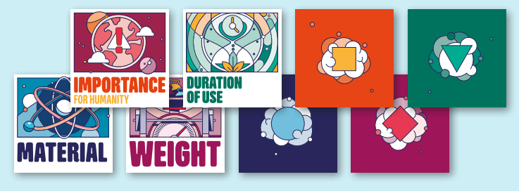
15 category cards