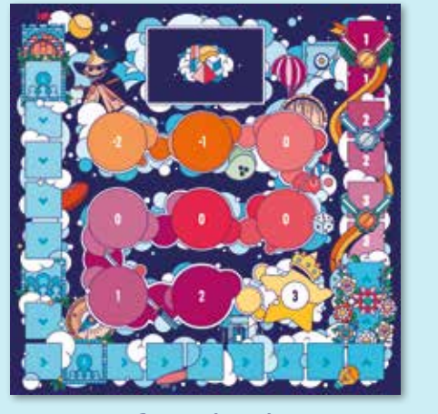
1 game board