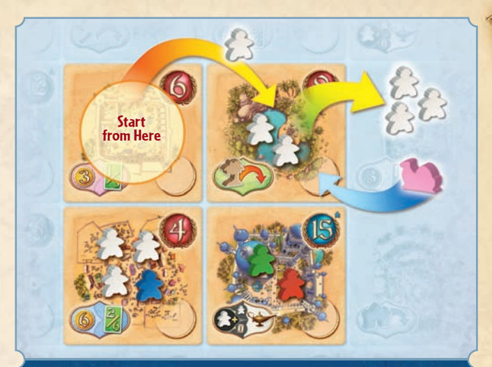
Moving onto the Tile already containing 2 White Meeples and none others, you end with 3 White Meeples in hand and take control of that Tile; if you'd opted to end your move on the Tile containing 3 White Meeples and 1 Blue one, you'd have 4 White Meeples in hand, but no control of the Tile.

place one of your Camels onto it to mark your ownership. At the end of the game, you will score the VPs associated with each Tile your Camels sit on.