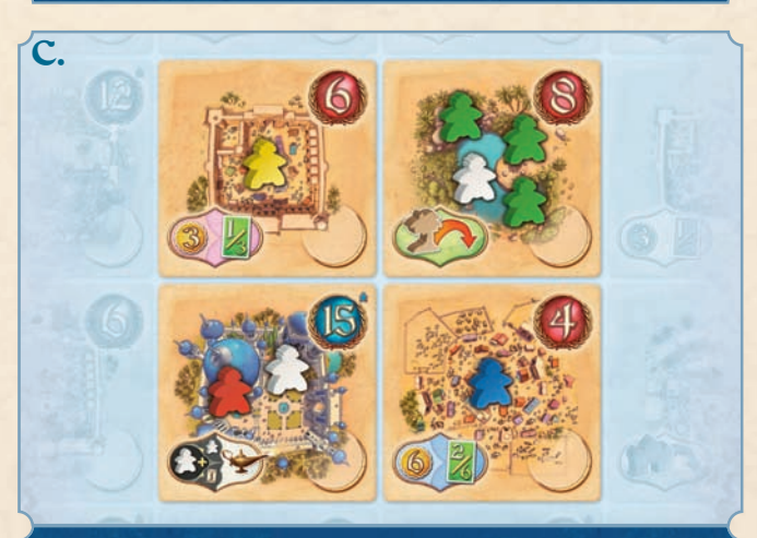
This move let the player regroup 3 green Meeples in the Oasis: he can now use these Merchants. The other Meeples were dropped on the other tiles during the move.

When discovering the game, we recommend laying the Meeples you drop down sideways rather than up, as you plan your move, so as to be able to back up if need be, during the planning stage of your move. Just remember to stand the Meeples back up once your move is complete.