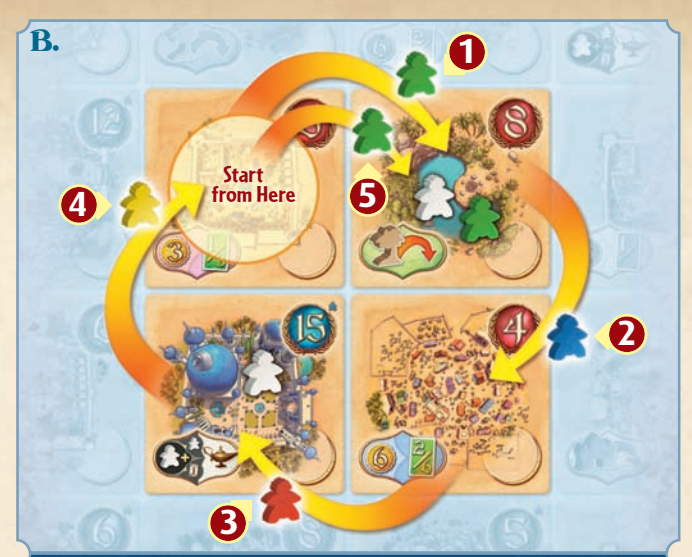
Taking all the Meeples from the Small Market tile in hand, the player then drops a green Meeple on the Oasis (1), a blue Meeple on the Big Market (2), a red Meeple on the Sacred Place (3), a yellow Meeple on the Small Market (4), and the last green Meeple on the Oasis (5).