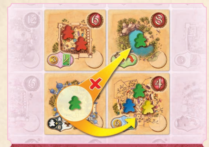
This green Meeple cannot reach the Oasis.

→ No Diagonal rule: All Meeples moves must be done sideways, from Tile to adjacent Tile, never in diagonal.