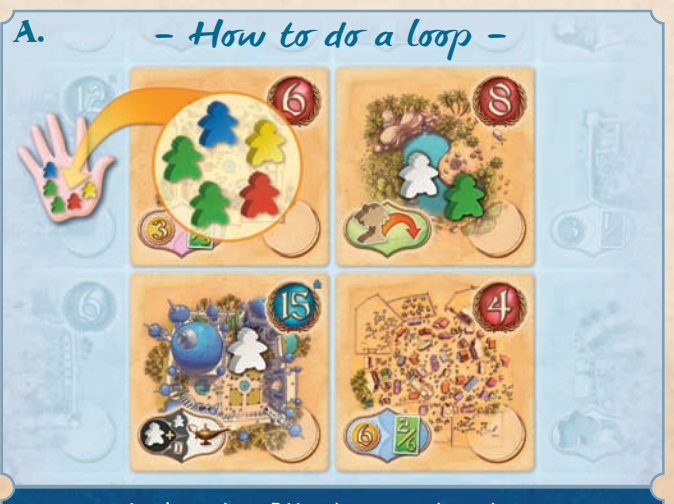
It takes at least 5 Meeples to complete a loop.

The second red Meeple cannot be dropped on the Small Market Tile, as this would be a backtracking move.